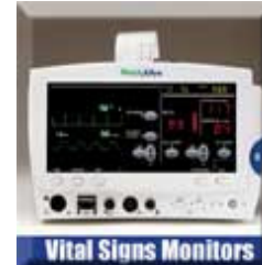
Vital Signs Monitors

Toco and Ultrasound Transducers: HP / Philips Corometrics