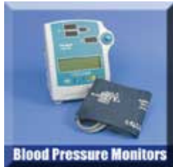
Blood Pressure Monitors